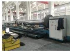
17. HEAVY LATHE