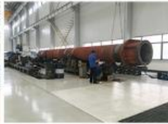
14. DEEP HOLE HONING