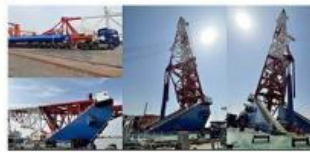
LUFFING CYLINDER FOR PILING BARGE