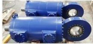
CEMENT CRUSHER CYLINDER