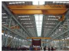
18. 100TON BRIDGE CRANE