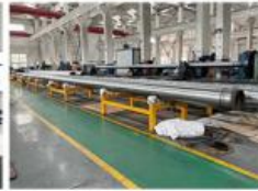
15. OUTSIDE HONING