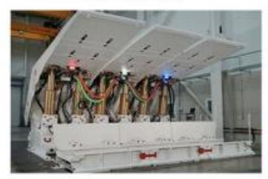
HYDRAULIC JACKING PLATFORM