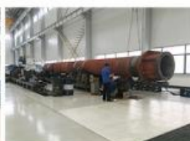
14. DEEP HOLE HONING