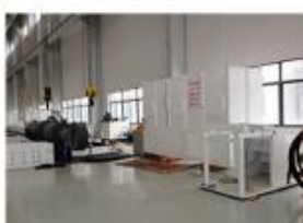
21. PRESSURE TEST BENCH