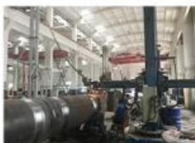
9. SUBMERGED ARC WELDING