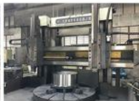
6. HEAVY VERTICAL LATHE