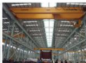
18. 100TON BRIDGE CRANE