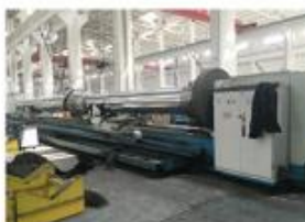
17. HEAVY LATHE