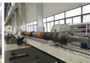
20. ASSEMBLY BENCH