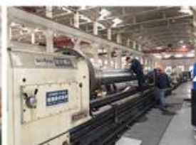
11. LARGE LATHE