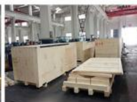
23. SEAWORTHY PACKING