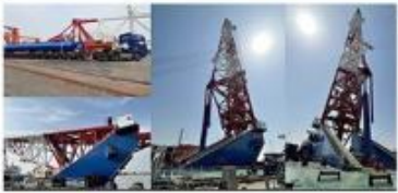
LUFFING CYLINDER FOR PILING BARGE