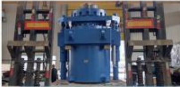
PLATE FLATTING MACHINE