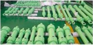
STANDARD SERIES CYLINDERS