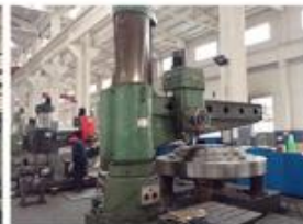
7. HEAVY DRILLING