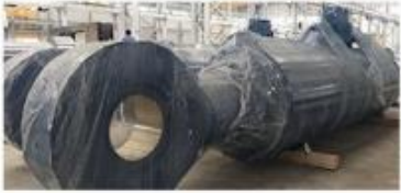
SPLIT HOPPER CYLINDER