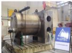
5. FLOOR BORING MACHINE