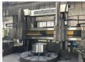
6. HEAVY VERTICAL LATHE