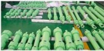
STANDARD SERIES CYLINDERS