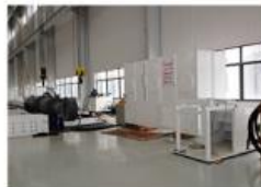
21. PRESSURE TEST BENCH