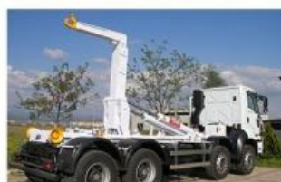
FORK LIFTING TRUCK