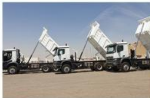
MOBILE DUMP TRUCK