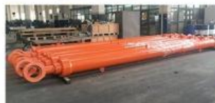
SPILLWAY GATE CYLINDER