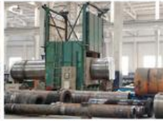
10. HEAT TREATMENT AFTER WELDING