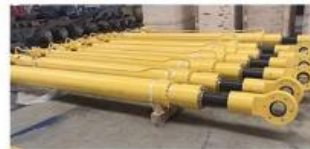
SPILLWAY GATE CYLINDER