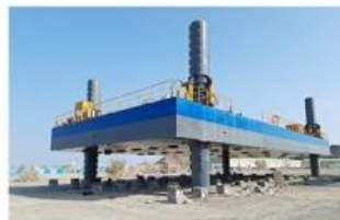
OFFSHORE JACKUP SYSTEM