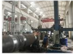
9. SUBMERGED ARC WELDING