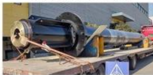
INNER GUIDING CYLINDER