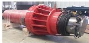
STEEL MILL CYLINDER