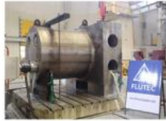
5. FLOOR BORING MACHINE