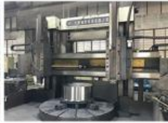
6. HEAVY VERTICAL LATHE