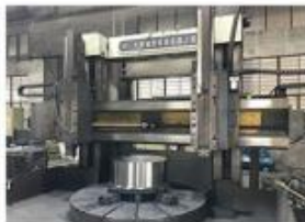
6. HEAVY VERTICAL LATHE