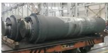
4000TON PRESS CYLINDER