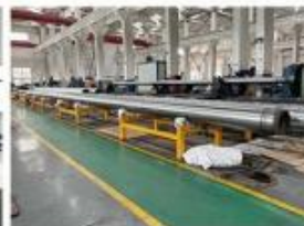
15. OUTSIDE HONING