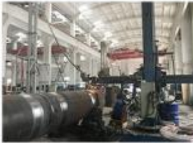
9. SUBMERGED ARC WELDING