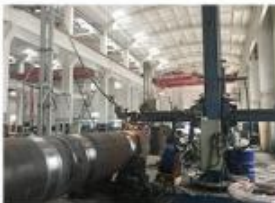
9. SUBMERGED ARC WELDING