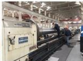
11. LARGE LATHE