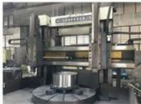
6. HEAVY VERTICAL LATHE