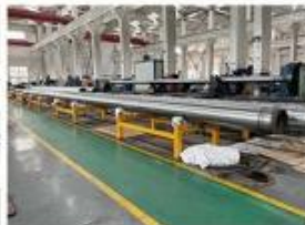
15. OUTSIDE HONING