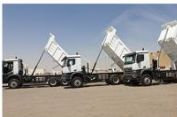
MOBILE DUMP TRUCK