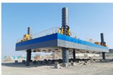
OFFSHORE JACKUP SYSTEM