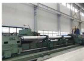
13. LARGE GRINDING