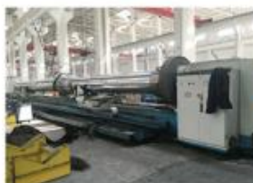
17. HEAVY LATHE