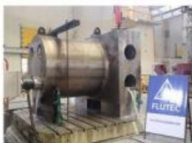
5. FLOOR BORING MACHINE