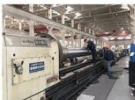
11. LARGE LATHE