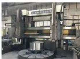
6. HEAVY VERTICAL LATHE