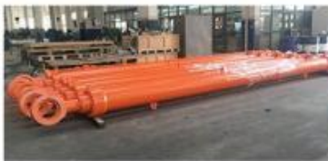
SPILLWAY GATE CYLINDER