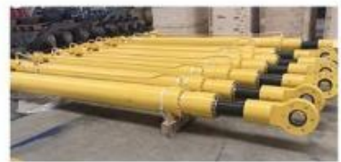
SPILLWAY GATE CYLINDER