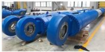
HYDROPOWER PLANT CYLINDER