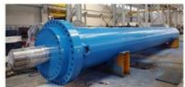
1500TON DRAW BENCH CYLINDER