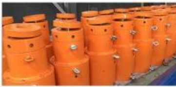
HYDRAULIC JACKING CYLINDER