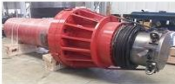
STEEL MILL CYLINDER