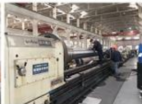
11. LARGE LATHE