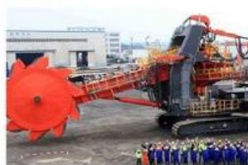
BUCKET WHEEL RECLAIMER