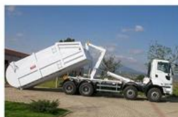
FORK LIFTING TRUCK