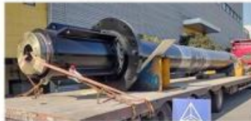
INNER GUIDING CYLINDER