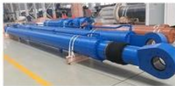
DAM GATE CYLINDER