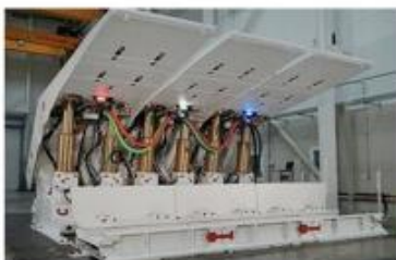
HYDRAULIC JACKING PLATFORM