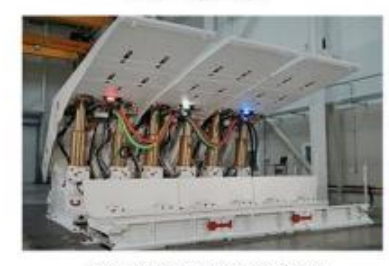
HYDRAULIC JACKING PLATFORM