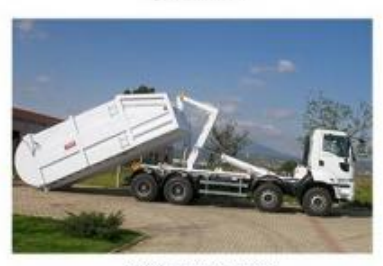
FORK LIFTING TRUCK