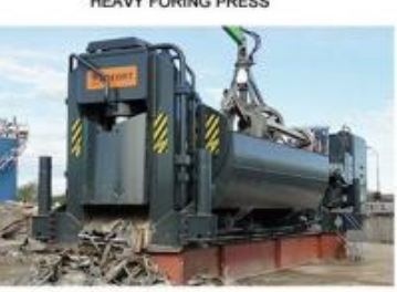
METAL SHEARING MACHINE