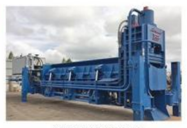
HYDRAULIC SHEAR BALER