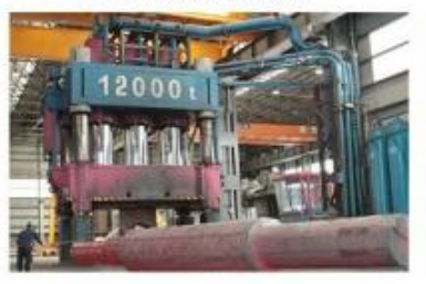
12000TON FORING PRESS