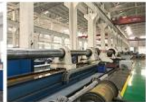
8. LARGE DEEP HOLE BORING