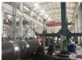
9. SUBMERGED ARC WELDING