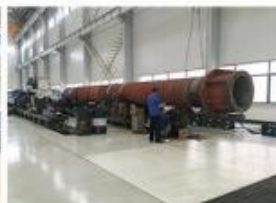
14. DEEP HOLE HONING