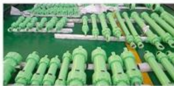
STANDARD SERIES CYLINDERS