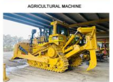
CIVIL ENGINEERING MACHINE