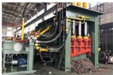
METAL SCRAP SHEAR