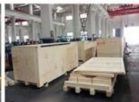
23. SEAWORTHY PACKING