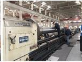
11. LARGE LATHE