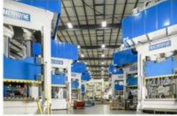
HYDRAULIC FORGING PRESS