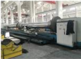
17. HEAVY LATHE