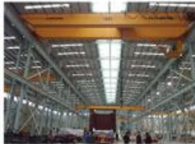
18. 100TON BRIDGE CRANE