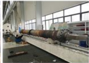
20. ASSEMBLY BENCH