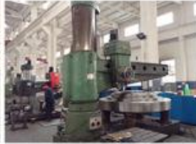
7. HEAVY DRILLING