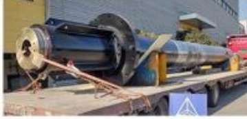
INNER GUIDING CYLINDER