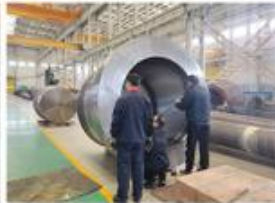
19. INSPECTION ONSITE