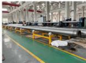
15. OUTSIDE HONING