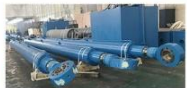
HYDRAULIC HOIST SYSTEM