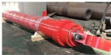
DOUBLE ACTING TELESCOPIC CYLINDER