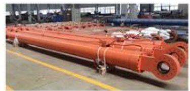
DAM GATE LIFT CYLINDER