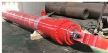
DOUBLE ACTING TELESCOPIC CYLINDER