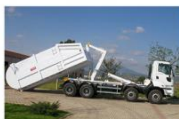
FORK LIFTING TRUCK