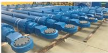
HYDROPOWER PLANT CYLINDER