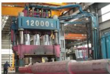
12000TON FORING PRESS