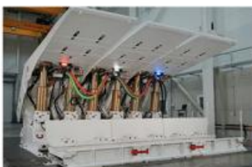
HYDRAULIC JACKING PLATFORM