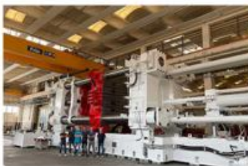
HEAVY EXTRUSION PRESS