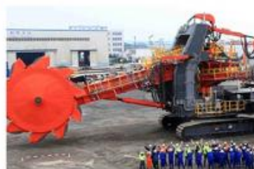
BUCKET WHEEL RECLAIMER