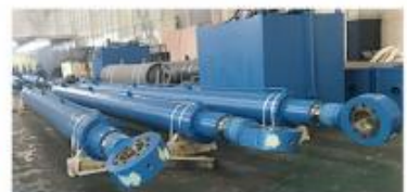
HYDRAULIC HOIST SYSTEM