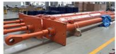
INLET GATE CYLINDER