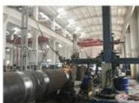
9.SUBMERGED ARC WELDING