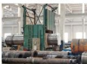
10. HEAT TREATMENT AFTER WELDING