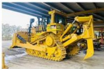
CIVIL ENGINEERING MACHINE