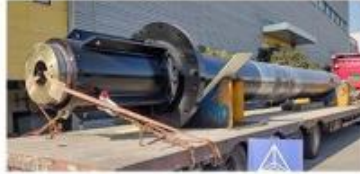
INNER GUIDING CYLINDER