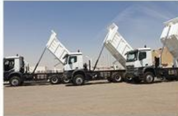
MOBILE DUMP TRUCK