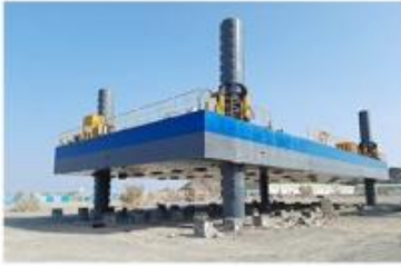
OFFSHORE JACKUP SYSTEM