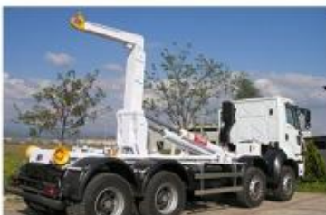
FORK LIFTING TRUCK