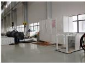
21.PRESSURE TEST BENCH