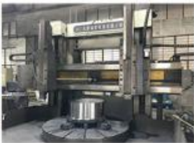
6.HEAVY VERTICAL LATHE