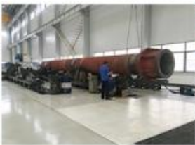
14.DEEP HOLE HONING