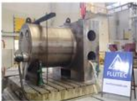
5.FLOOR BORING MACHINE