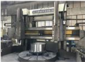
6.HEAVY VERTICAL LATHE