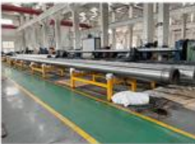
15. OUTSIDE HONING