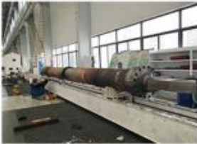
20. ASSEMBLY BENCH