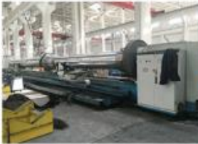
17. HEAVY LATHE