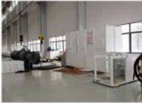
21.PRESSURE TEST BENCH