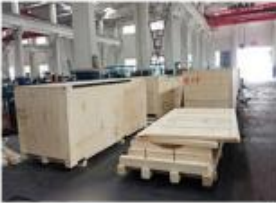
23. SEAWORTHY PACKING