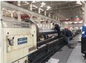
11. LARGE LATHE