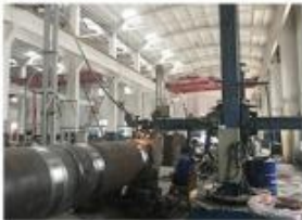
9.SUBMERGED ARC WELDING