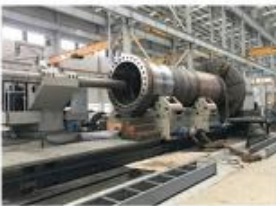
3.HEAVY CNC MACHINE