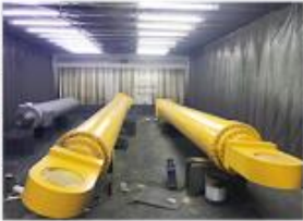
22. PAINTING BOOTH