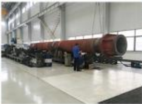
14.DEEP HOLE HONING