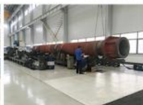
14. DEEP HOLE HONING