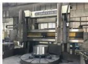
6. HEAVY VERTICAL LATHE