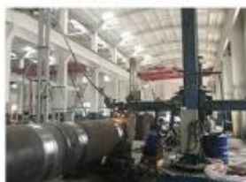
9. SUBMERGED ARC WELDING