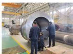
19. INSPECTION ONSITE