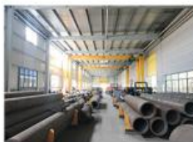
1. RAW MATERIAL WAREHOUSE