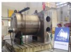
5. FLOOR BORING MACHINE