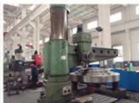
7. HEAVY DRILLING