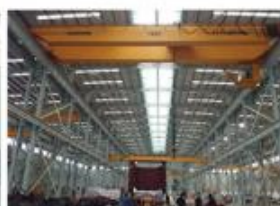
18. 100TON BRIDGE CRANE