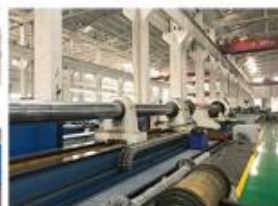
8. LARGE DEEP HOLE BORING