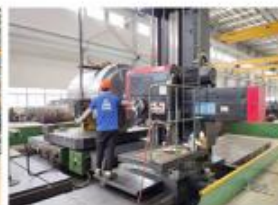
4. FLOOR DRILLING