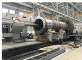
3. HEAVY CNC MACHINE