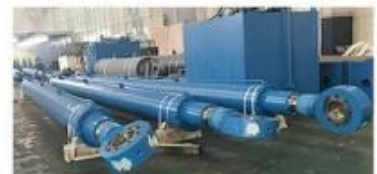
HYDRAULIC HOIST SYSTEM