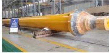
1000TON DRAW BENCH CYLINDER