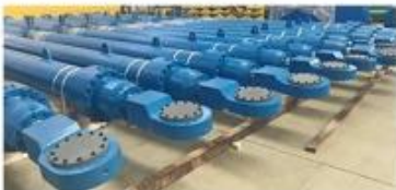
HYDROPOWER PLANT CYLINDER