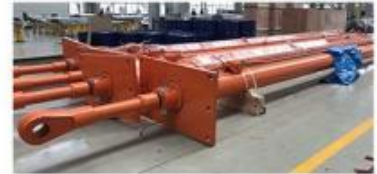
INLET GATE CYLINDER