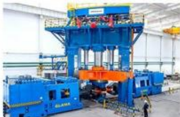
DEEP DRAW PRESS MACHINE