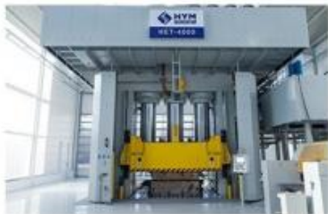
4000TON HYDRAULIC PRESS