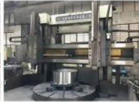
6. HEAVY VERTICAL LATHE