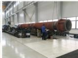
14. DEEP HOLE HONING