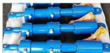
STEEL INDUSTRY CYLINDER