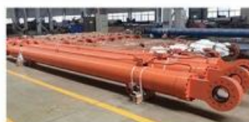
DAM GATE LIFT CYLINDER