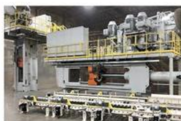
550TON EXTRUSION MACHINE