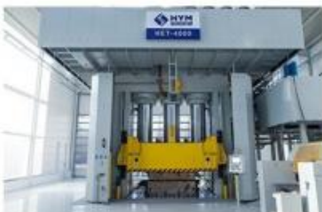
4000TON HYDRAULIC PRESS