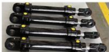
STEEL MILL CYLINDER