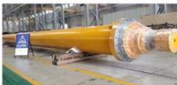
1000TON DRAW BENCH CYLINDER