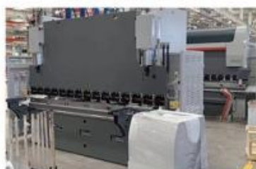
HYDRAULIC BRAKE PRESS