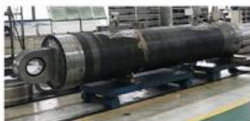
OFFSHORE OIL RIG CYLINDER