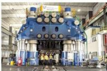
HEAVY FORGING PRESS