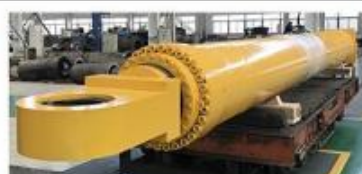
SHIP CRANE CYLINDER