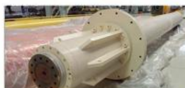
ALUMINIUM CASTING CYLINDER