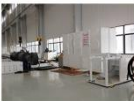
21. PRESSURE TEST BENCH