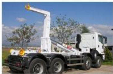
FORK LIFTING TRUCK