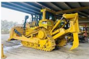
CIVIL ENGINEERING MACHINE