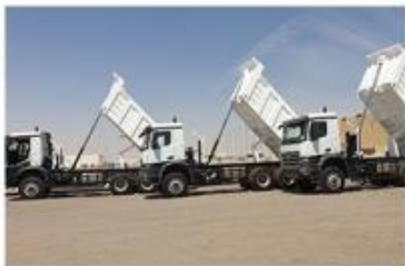
MOBILE DUMP TRUCK