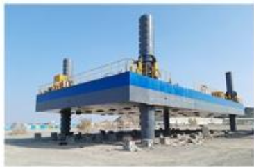
OFFSHORE JACKUP SYSTEM