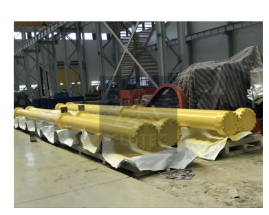
Finished Product Display