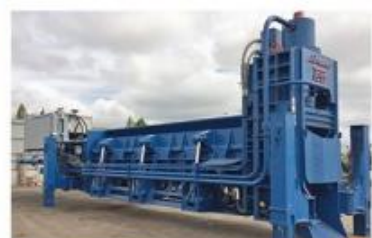
HYDRAULIC SHEAR BALER