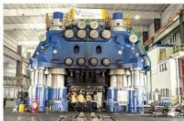
HEAVY FORING PRESS