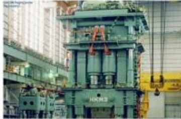
5000TON HYDRAULIC PRESS