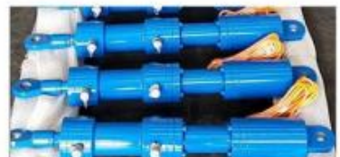
STEEL INDUSTRY CYLINDER