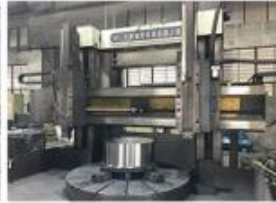
6. HEAVY VERTICAL LATHE