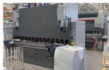
HYDRAULIC BRAKE PRESS