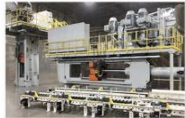
550TON EXTRUSION MACHINE