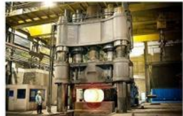
12000TON FORGING PRESS