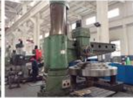
7. HEAVY DRILLING