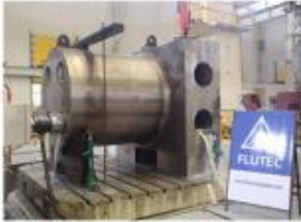
5. FLOOR BORING MACHINE