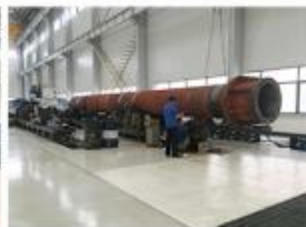
14. DEEP HOLE HONING