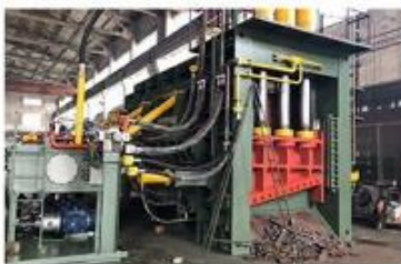
METAL SCRAP SHEAR