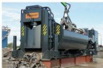
METAL SHEARING MACHINE