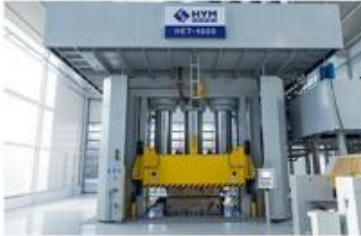
4000TON HYDRAULIC PRESS