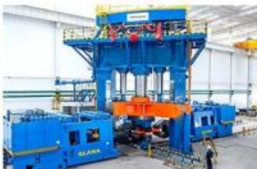
DEEP DRAW PRESS MACHINE