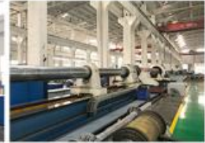
8. LARGE DEEP HOLE BORING