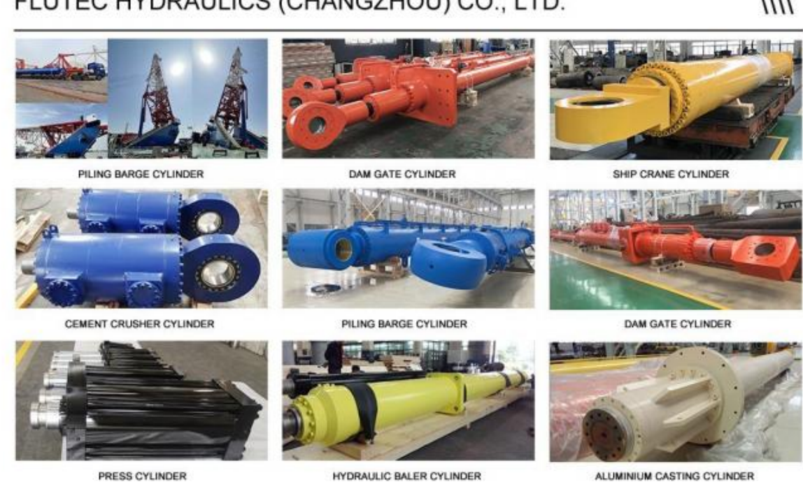
PRESS CYLINDER HYDRAULIC BALER CYLINDER