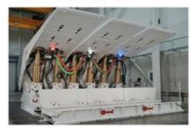
HYDRAULIC JACKING PLATFORM