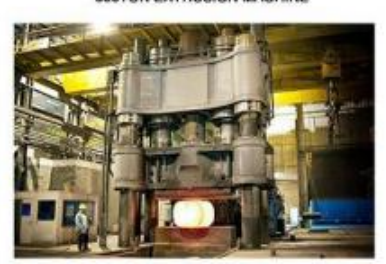
12000TON FORGING PRESS