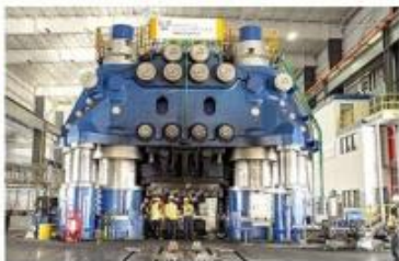
HEAVY FORING PRESS