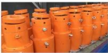
HYDRAULIC JACKING CYLINDER