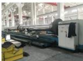
17. HEAVY LATHE