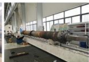
20. ASSEMBLY BENCH