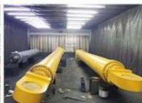
22. PAINTING BOOTH