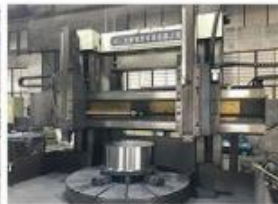
6. HEAVY VERTICAL LATHE