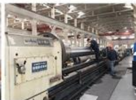
11. LARGE LATHE