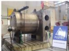
5. FLOOR BORING MACHINE