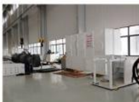
21. PRESSURE TEST BENCH