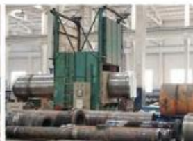
10. HEAT TREATMENT AFTER WELDING