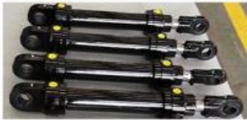
STEEL MILL CYLINDER