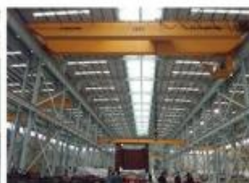
18. 100TON BRIDGE CRANE