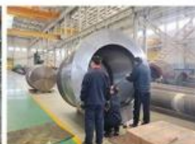
19. INSPECTION ONSITE