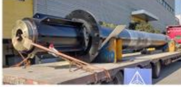
INNER GUIDING CYLINDER