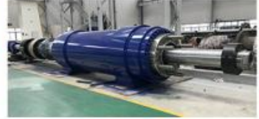
ALUMINIUM PLATE STRETCH CYLINDER