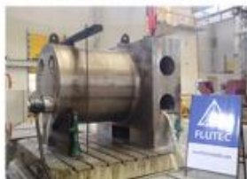
5.FLOOR BORING MACHINE