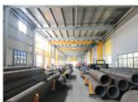
1.RAW MATERIAL WAREHOUSE