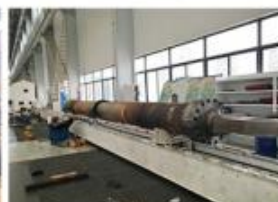
20. ASSEMBLY BENCH