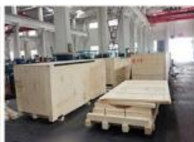
23. SEAWORTHY PACKING