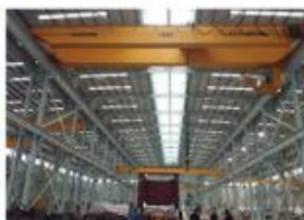
18.100TON BRIDGE CRANE