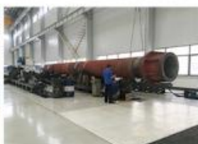
14.DEEP HOLE HONING