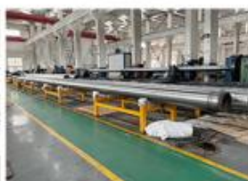
15. OUTSIDE HONING