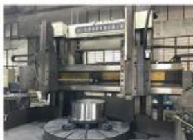
6.HEAVY VERTICAL LATHE