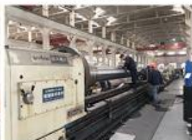
11. LARGE LATHE