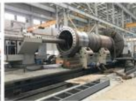
3.HEAVY CNC MACHINE