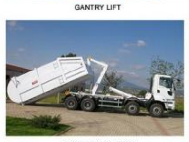
FORK LIFTING TRUCK