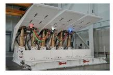
HYDRAULIC JACKING PLATFORM