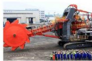
BUCKET WHEEL RECLAIMER