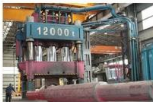
12000TON FORGING PRESS