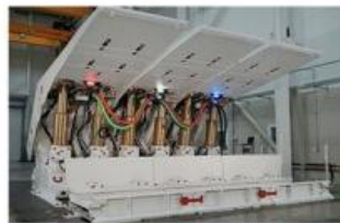
HYDRAULIC JACKING PLATFORM