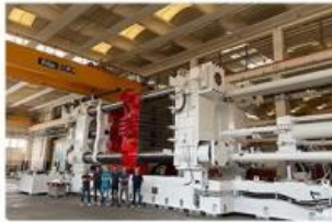
HEAVY EXTRUSION PRESS