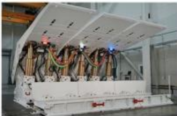
HYDRAULIC JACKING PLATFORM