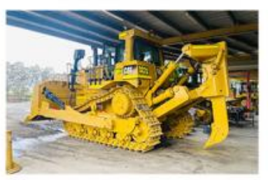
CIVIL ENGINEERING MACHINE