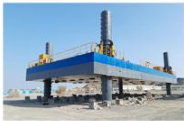
OFFSHORE JACKUP SYSTEM