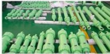
STANDARD SERIES CYLINDERS