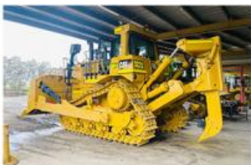
CIVIL ENGINEERING MACHINE