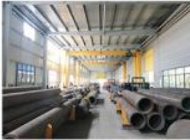
1. RAW MATERIAL WAREHOUSE