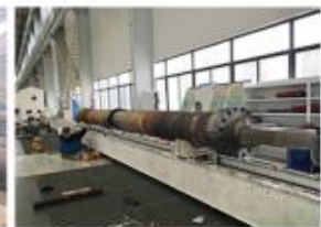
20. ASSEMBLY BENCH