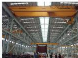
18. 100TON BRIDGE CRANE