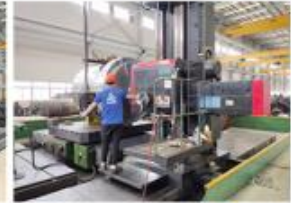
4. FLOOR DRILLING