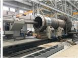
3. HEAVY CNC MACHINE