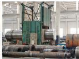
10. HEAT TREATMENT AFTER WELDING