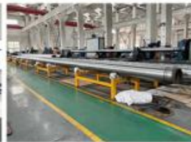
15. OUTSIDE HONING