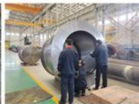
19. INSPECTION ONSITE