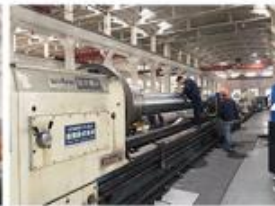
11. LARGE LATHE