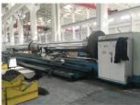
17. HEAVY LATHE