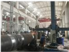
9. SUBMERGED ARC WELDING