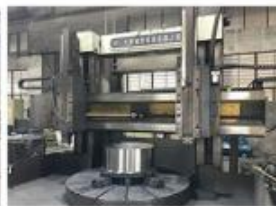
6. HEAVY VERTICAL LATHE