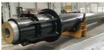
ALUMINIUM CASTING CYLINDER