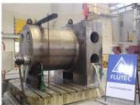
5. FLOOR BORING MACHINE