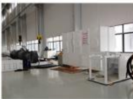
21. PRESSURE TEST BENCH