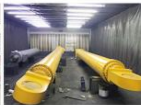
22. PAINTING BOOTH