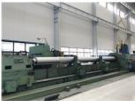
13. LARGE GRINDING