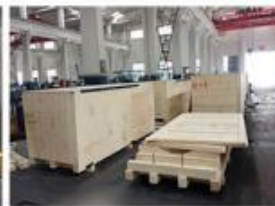
23. SEAWORTHY PACKING