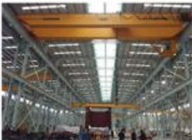
18.100TON BRIDGE CRANE