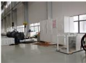
21.PRESSURE TEST BENCH