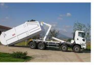
FORK LIFTING TRUCK