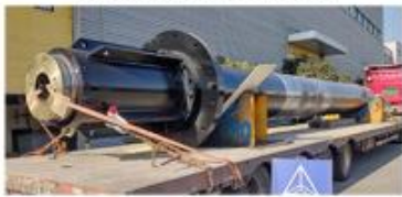
INNER GUIDING CYLINDER