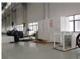
21.PRESSURE TEST BENCH