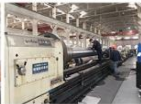
11. LARGE LATHE