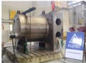
5.FLOOR BORING MACHINE