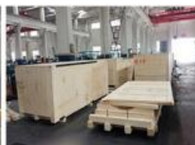
23. SEAWORTHY PACKING