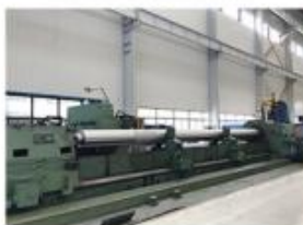
13. LARGE GRINDING