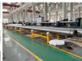
15. OUTSIDE HONING