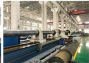
8.LARGE DEEP HOLE BORING