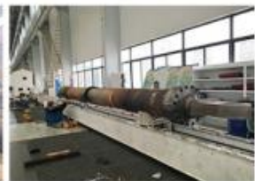
20. ASSEMBLY BENCH