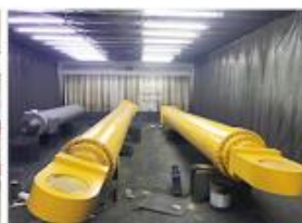
22. PAINTING BOOTH