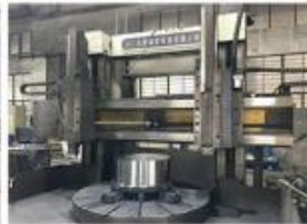
6.HEAVY VERTICAL LATHE