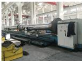
17. HEAVY LATHE