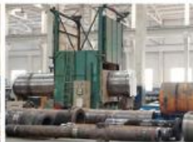
10. HEAT TREATMENT AFTER WELDING