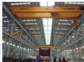
18.100TON BRIDGE CRANE